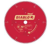
Freud Diablo Non-Ferrous 96T x 12"